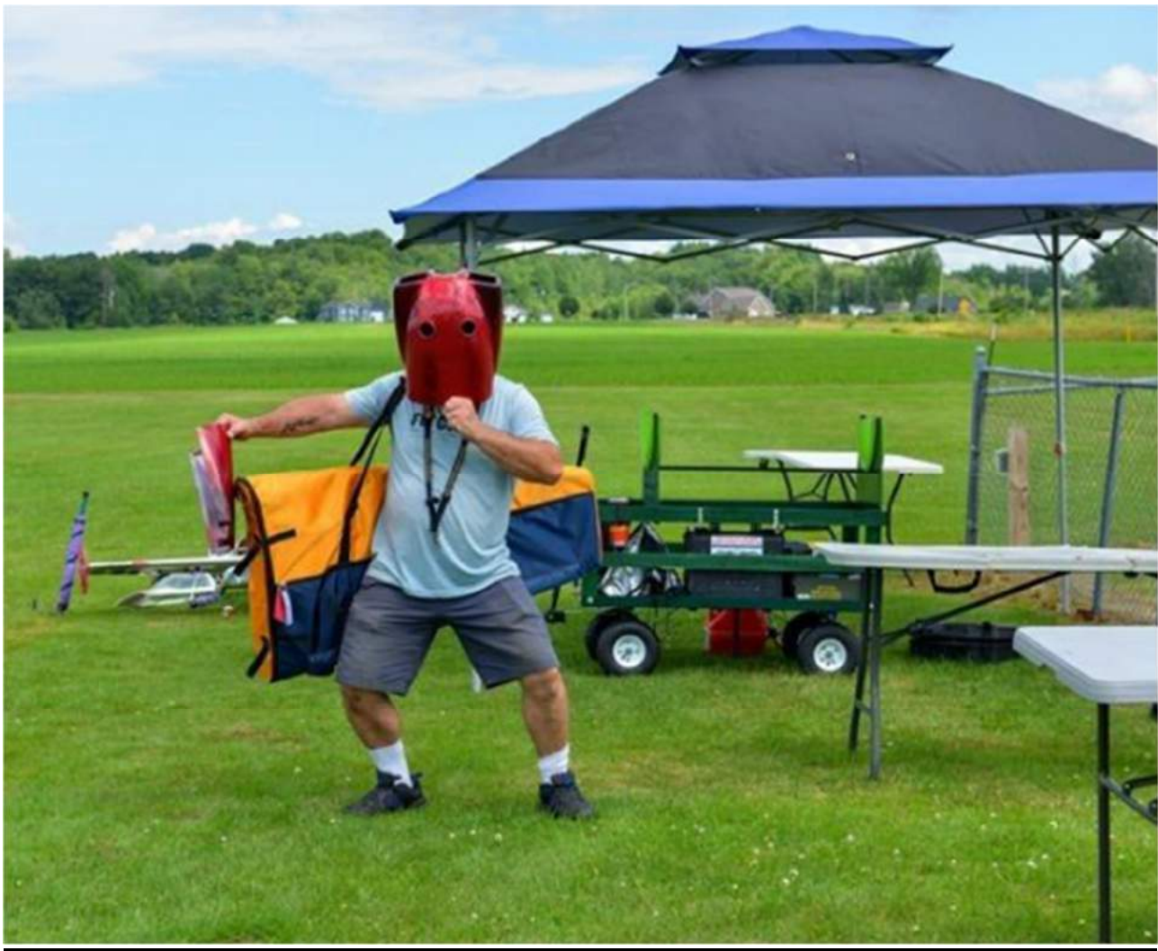
STARS HelijAM 2023

https://www.dropbox.com/scl/fo/txu07271ujnwjkr71wh38/h?rlkey=0rfleejj9jrynkymshp0kf5p&dl=0