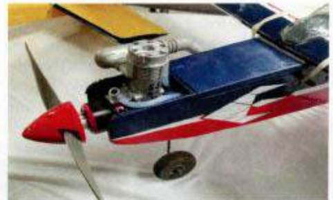
An electric Falcon with a dummy gas engine.